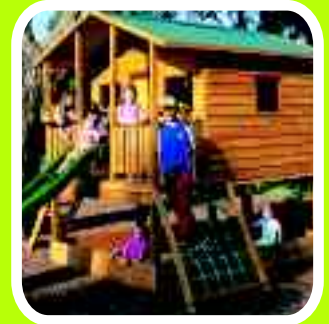
Elevated Mansion 1500mm Kit

The Mansion is the largest cubby in our range. Once the kids have grown up, the Mansion makes the perfect storage room. Popular with Kindergartens and Child Care Centres.