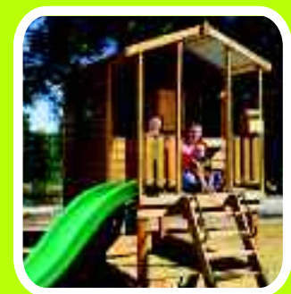
Elevated Townhouse 1500mm Kit

The Townhouse offers the same floor plan as the Cottage but with our signature verandah. The Townhouse will enhance any backyard.