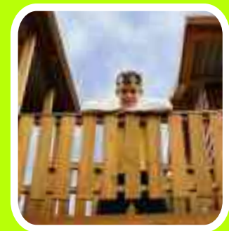
“any active kid’s fantasy”

Sheltered from the elements yet still unobtrusive in design, the Roof Fort is ideal for exposed settings. It will get your kids away from the TV and outside doing something healthy and active. Double the fun by linking your fort to a cubby with a combo bridge.