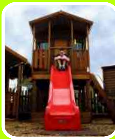
600mm elevation kit

The 1500mm elevation kit allows for the addition of a 3.1m double wave slide and 1.5m scramble net. It comes standard with a sandpit which supports and braces the free standing 1.8m posts. For sites with height restrictions you can cut the posts and ladder down to your preferred height and add a 2.5m slide.