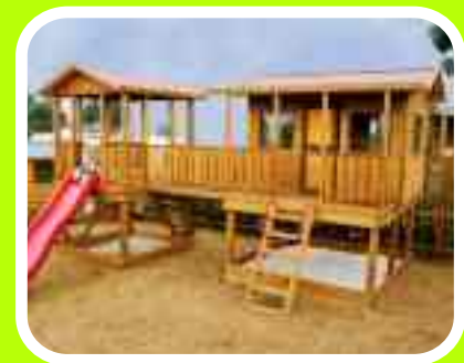
“monster size monster fun”

The open design of the Monster Fort is great for kid’s parties or big active families. Accessories can be added to further enhance its appeal. If you have plenty of space add a Mansion to your Monster Fort for a 10m x 10m extravaganza.