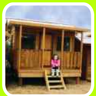
Elevated Homestead 4500mm Kit

This classically styled cubby has a tiered roof covering its generous 2.4m wide verandah, providing plenty of room for bikes and furniture. Inside, there is ample space to move the beds in and have a slumber party!