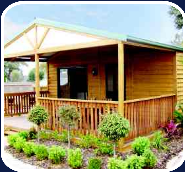
6.0m x 7.5m bungalow with 3.0m gable verandah

Provide an alternative for living with family whilst retaining your independence and privacy. Without compromising your lifestyle, you can have the security & peace of mind knowing your loved ones are near by.