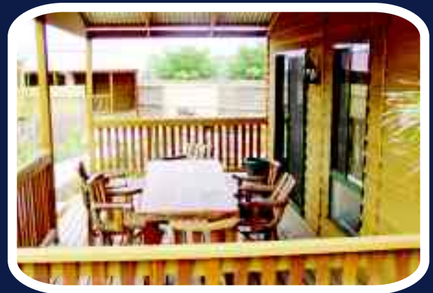
A spacious 3.0m verandah is ideal for entertaining.