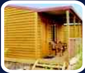
1.5m verandah on side

Our signature verandahs feature an overhanging roof, jarrah pickets and kiln dried treated pine posts, handrails and decking. Two sizes are available, 1.5m and 3.0m, and they can be positioned on either the side or gable end of your unit.