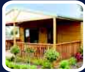
3.0m verandah on gable