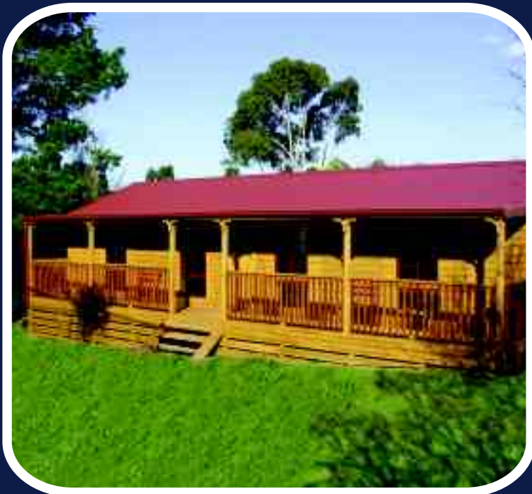
4.5m x 13.5m bungalow with a 1.5m side verandah

With staff only too happy to help you design your dream home, your options are unlimited. Our spacious 3m verandahs are very popular, providing ample room for entertaining.