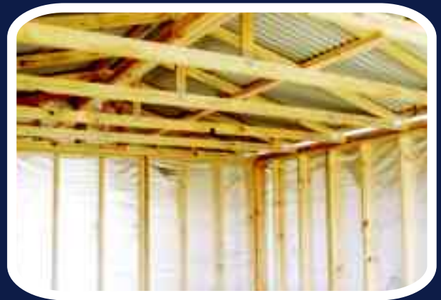
'Truss roof' option