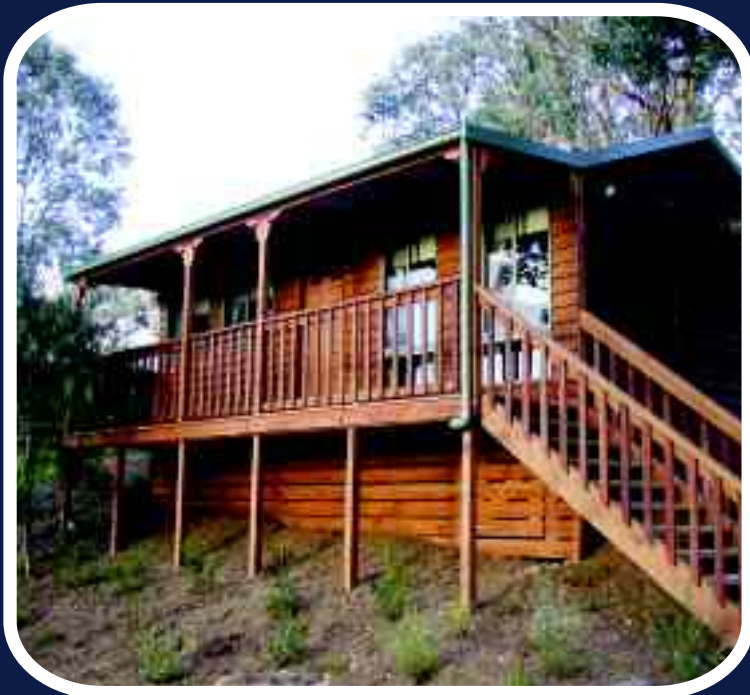
4.5m x 7.5m bungalow with 1.5m side verandah and custom steps & handrails, and enclosed subfloor for elevated sites

The natural timber style and homely feel of our bungalow range lends itself to “Bed & Breakfast” settings. Our modular design enables delivery of multiple units to your property with minimal access required.