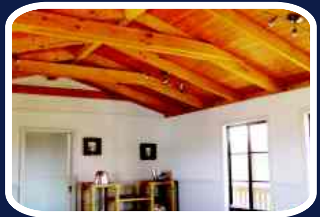
Stained 'Cathedral Ceiling' roof option