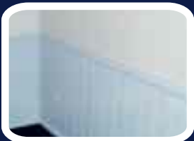
Optional Dado Wall with plaster finish

The classic cathedral ceiling option gives our bungalows that “home away from home” feeling as soon as you walk in the front door. The open ceiling featuring exposed rafters and pine lining boards, creates an uninhibited spacious atmosphere.