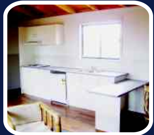
“The perfect getaway”

With staff only too happy to help you design your dream home, your options are unlimited. Our spacious 3m verandahs are very popular, providing ample room for entertaining.