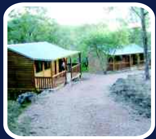
“Ideal for country settings”

The natural timber style and homely feel of our bungalow range lends itself to “Bed & Breakfast” settings. Our modular design enables delivery of multiple units to your property with minimal access required.