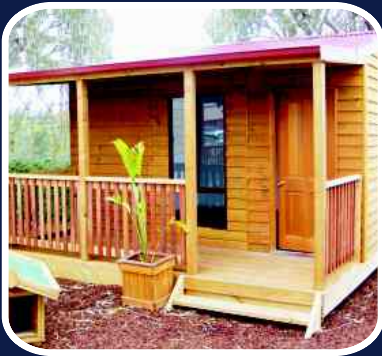
3.6m x 4.5m bungalow with a 1.5m side verandah

If space is limited in your backyard, our small bungalows are ideal for home offices, art studios, teenage retreats or extra bedrooms. You have the option of simply having an open shell or adding a separate ensuite.