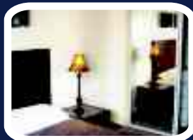
Full Plaster finish